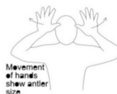
Movement of hands show antler size