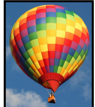
hot air balloon