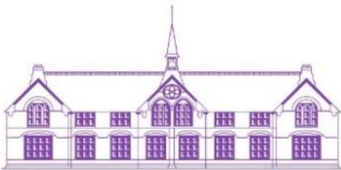
New Town Primary School